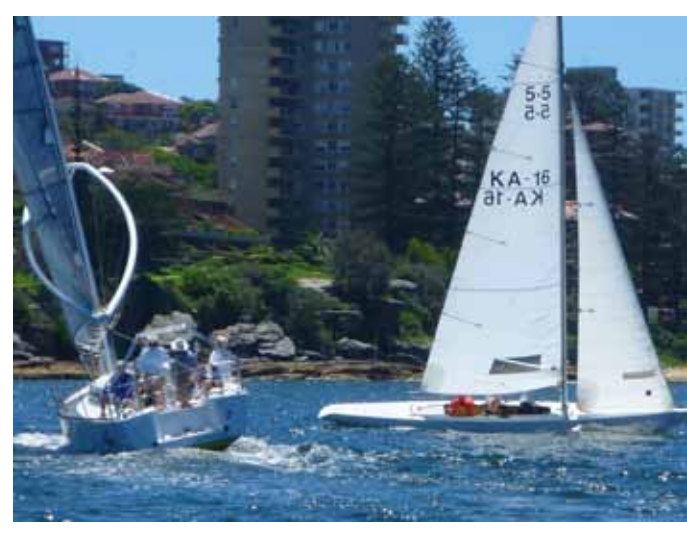
From the top - Bokarra, San Toy, Pam and Runaway Taxi